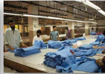
Garment Review, Trimming & Alteration