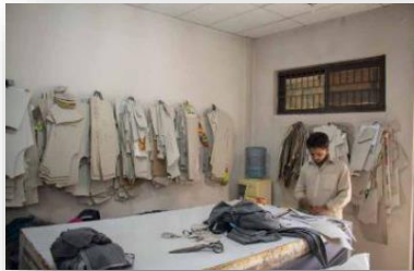
Sampling & Developments