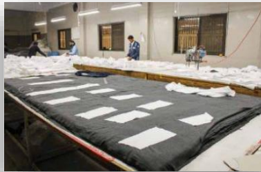
Cutting & Panel Inspection