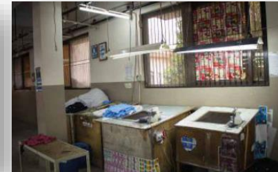
Washing, Pressing & Needle Detector