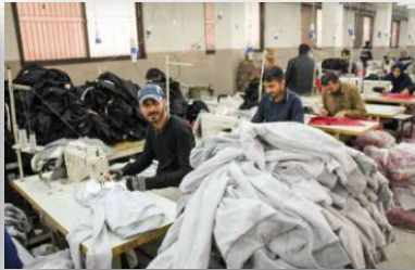
Stitching & Inline Inspection